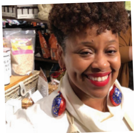
With a smile that can light up any room, Tiffany D. is ready to help you find the perfect gift.