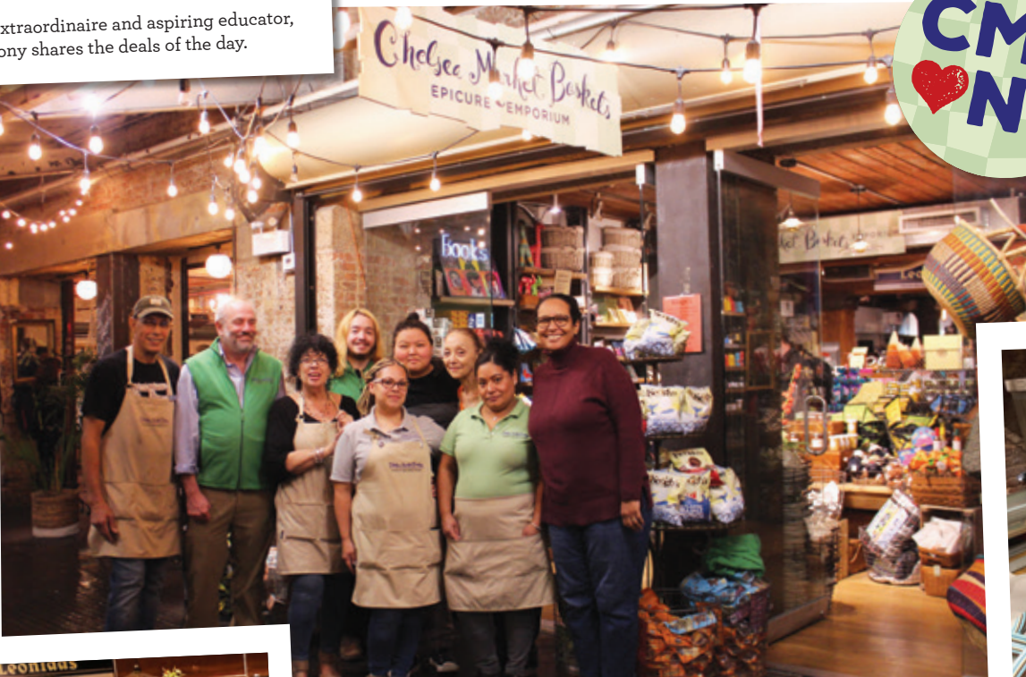
Quick shot of the crew on a Friday afternoon in October.